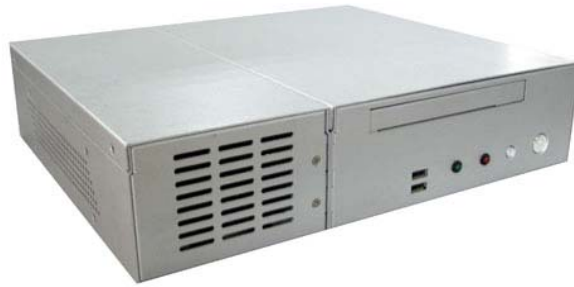
Smallest Industrial Appliance(P4 Level)