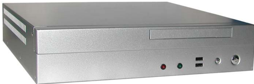
Smallest Industrial Appliance(P4 Level) With 2 Expansion slot