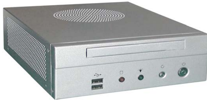
Smallest Industrial Appliance(P4 Level)